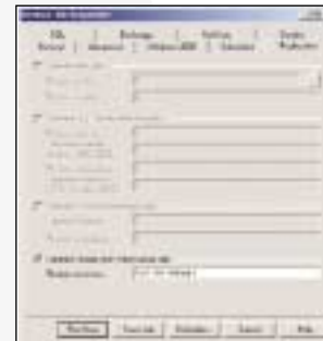
Easily redirect a full system restore to an alternate SharePoint Portal Server in the event of a server failure.

*** Backup Exec SAN Shared Storage Option required