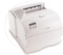
Lexmark Optra T614/nl